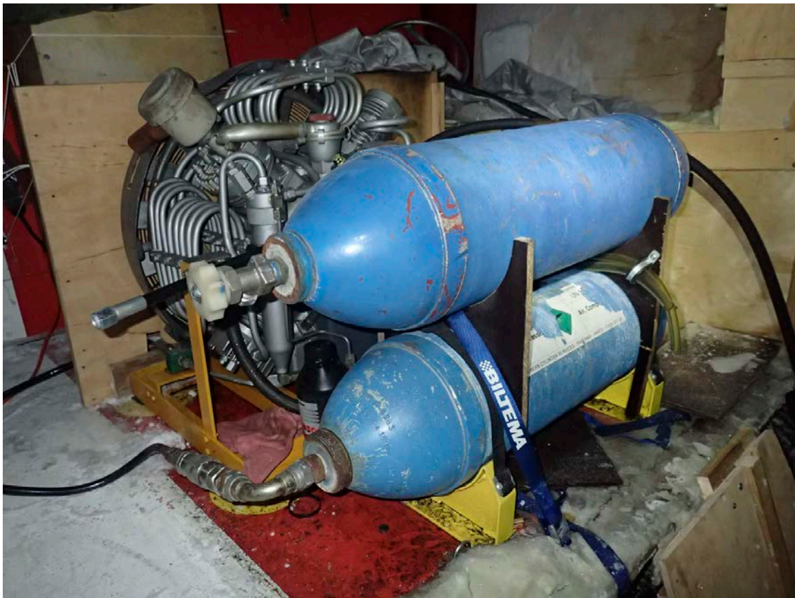
Fig. 3 The compressor (240 liters/min) and air bottles (40 liter) for supply of air to the air gun mounted on the port deck of the hovercraft.

In practical terms, the loss of the generators means; no melting of snow by electric heating (i.e. no showers), no use of the electrical oven for cooking, no electric heat on the compressor (Fig. 3) and hydraulic oil reservoir, no use of the heat gun and no outside lightening. The most inconvenient issue is loss of heat on the compressor, but this will be compensated by a diesel fired stove.