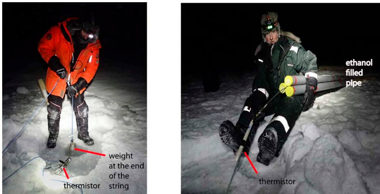
Fig. 4. Deploying the 300 meter long thermistor string

Audun finished resetting the 30 thermistor probes and the 300 meter long string was redeployed on Thursday (Fig. 4).